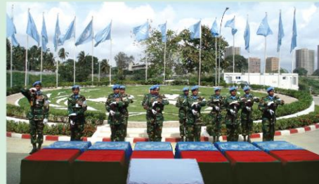
Final Homage to Martyr Peacekeepers of Bangladesh