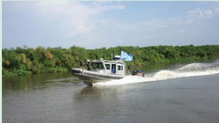
Peacekeepers of Bangladesh Navy Patrolling in South Sudan Mission Area