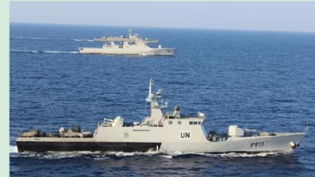
Bangladesh Navy Ship NIRMUL is on Patrol at Mediterranean Sea