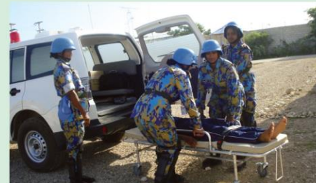
Peacekeepers of Bangladesh Police Providing Humanitarian Assistance in Mission Area