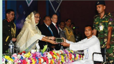
Hon'ble Prime Minister Awards injured UN Peacekeepers of Bangladesh Army