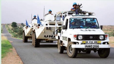
APC Patrol of Bangladesh Army Peacekeepers in Darfur Sudan