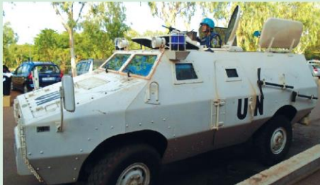
Bangladesh Police Unit Patrolling in Mission Area