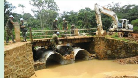
Bangladesh Army Engineer Contingent is Constructing Culvert in DR Congo