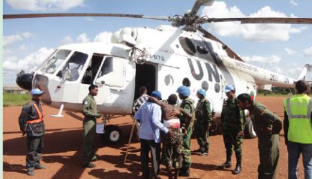
Medical Evacuation is being Carried out by Bangladesh Air Force Helicopter