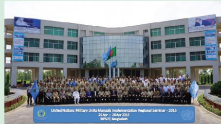
UN Military Units Manuals Implementation Regional Seminar-2016 in BIPSOT