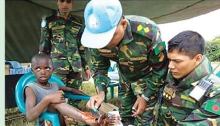
Peacekeepers of Bangladesh Army Providing Humanitarian Assistance