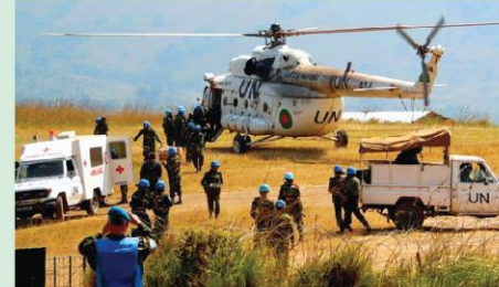
Bangladesh Air Force Peacekeepers Operating in MINUSCO, DR Congo